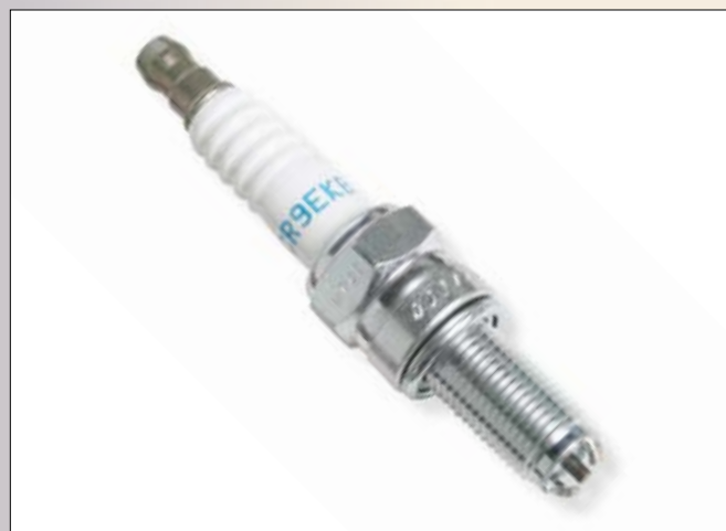
Spark Plug CR9EKB

· Original equipment replacement spark plug.