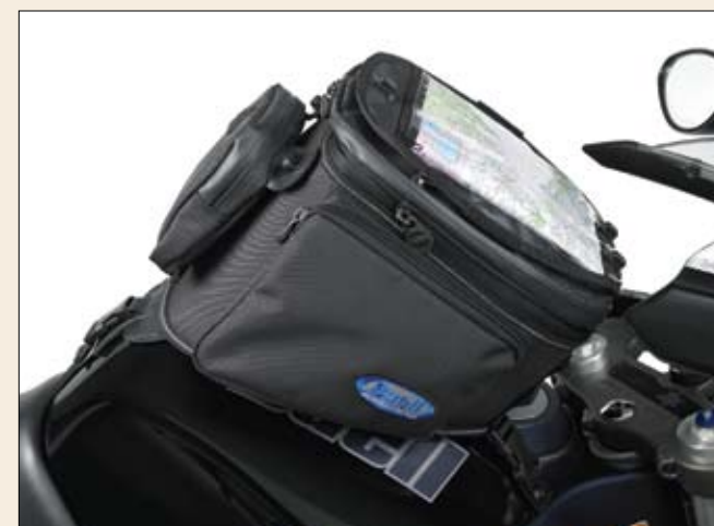
Deluxe Tank Bag