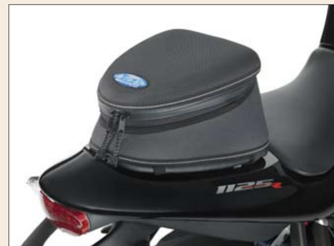
Deluxe Tail Bag

Fits all '03-later XB and '08 1125R models.