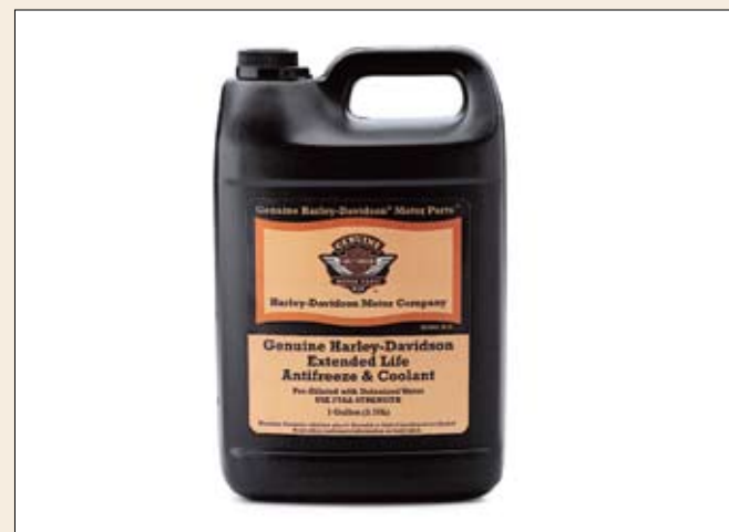
Genuine Harley-Davidson® Extended Life Antifreeze and Coolant